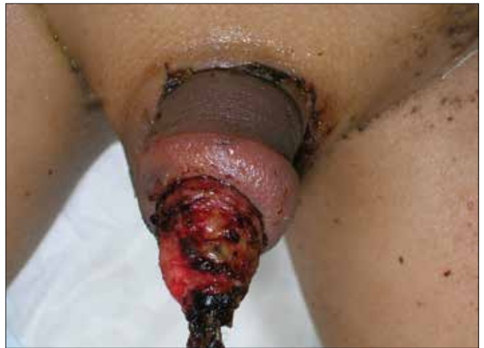
Figure 3. During the healing

follow up the patient was doing well with a good urine stream at the examination (Figure 4). Because of familial problems the patient and his mother moved to another city and he was lost to further follow up. In the strangulation group, the first patient was a 6 year-old boy presented with a hair tie splitting the urethra, the patient and his mother denied the circumstances and the date of the accident. The urethra and the corpus spongiosum were completely split at the coronal area (Figure 5). The hair tie was removed under general anesthesia (Figure 6) and 6 months later a dissection of both ends of the urethra with anastomosis was performed. The postoperative course was uneventful; the transurethral catheter was removed on the 15 th postoperative day. After 3 years of follow-up the patient had a good urine stream (Figure 7), the glans was sensible, and morning erections were present. The second patient of this group presented with a swollen penis in a constricting nut (Figure 8). Under general anesthesia the nut was cut (Figure