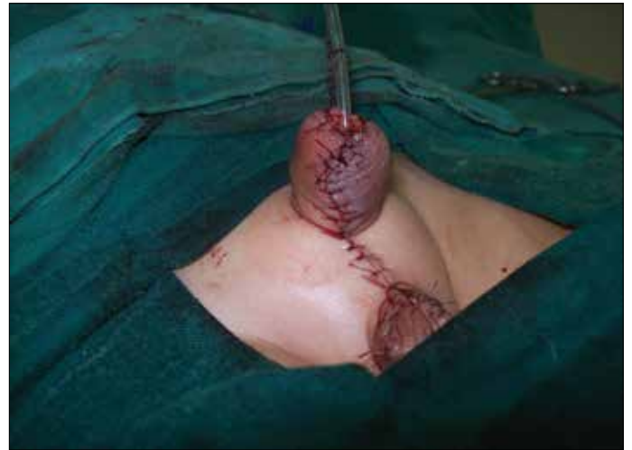
Figure 11. Phalloplasty by the dissection of the remaining corpus cavernosum and closure of the defect with scrotal flaps

defect was closed with scrotal flaps (Figure 15). The postoperative course was uneventful and the patient was satisfied. After one year follow-up the urine stream was good without meatal stenosis.