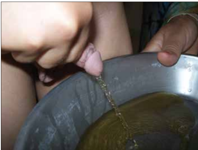
Figure 7. Good urine stream at 6 months of follow up after anastomosis

9) and five days later the edema resolved and the patient discharged. In the circumcision accident group, the patient with penile amputation presented 6 hours after the accident without the amputated penis in a tertiary center. Hemostasis was achieved and stitches between urethral mucosa and skin of the penile stump were made to prevent stenosis. The patient was referred to our center 4 months later (Figure 10). A phalloplasty was performed, the penile stump was dissected, the suspensory ligament was divided and scrotal flaps were used to cover the penis (Figure 11). The postoperative course was uneventful