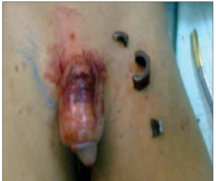
Figure 9. After cutting the nut