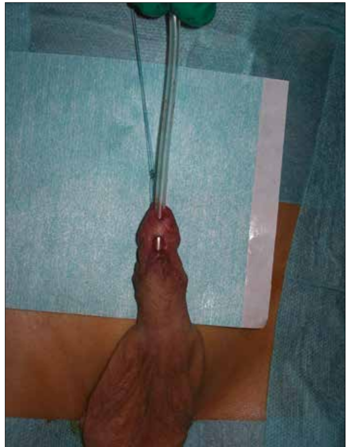
Figure 12. Glanular urethrocutaneous fistula