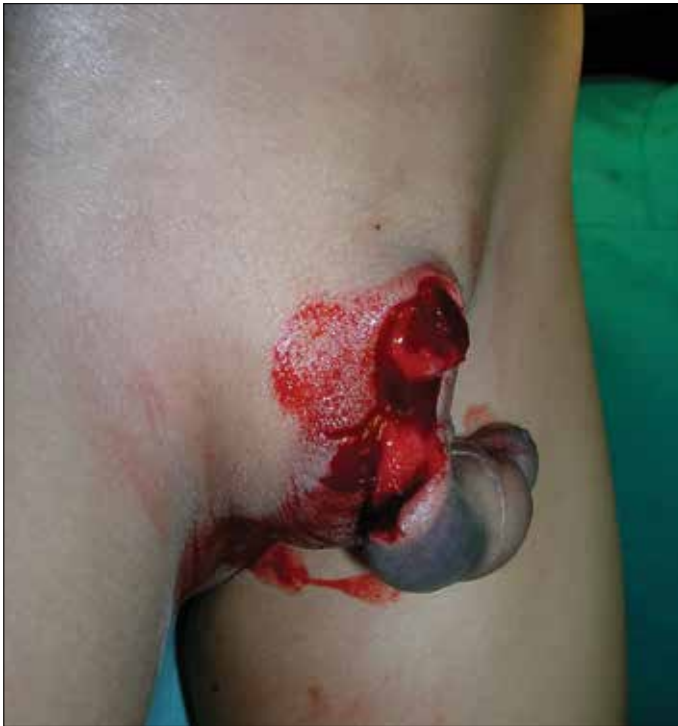
Figure 1. Lateral view of the amputated penis involving the complete transection of the penis

examination revealed that the amputation was in the base of the penis and involved the complete transection of the penis (corpus cavernosum, spongiosum and urethra) with only 1 cm wide skin tissue left. There were edema and signs of ischemia on the penis (Figure 1, 2). After passing a Foley catheter, a macroscopic re-implantation was performed with suturing urethra and tunica albuginea. The postoperative course under intravenous antibiotics and heparin was uneventful after the regeneration of a small necrotic area of the glans (Figure 3). The catheter was removed 2 weeks later. After 3 months of