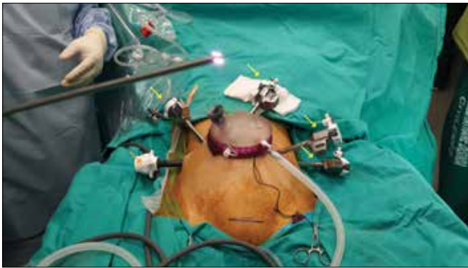
Figure 1. Placement of robotic ports and gel port. Yellow arrows indicate 8 mm robotic ports, orange, and green arrows assistant, and Gel ports, respectively