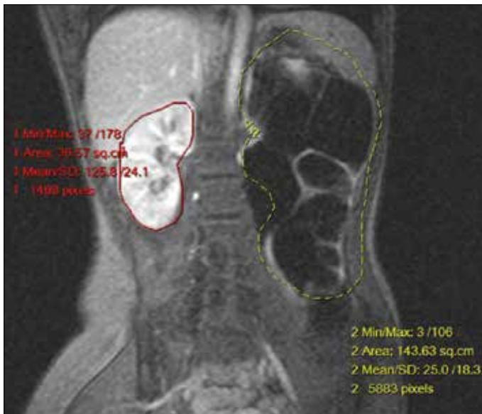
Figure 2. Dynamic contrast-enhanced MRI in a 14-year-old female. MR renogram images showing left PUJO with gross hydronephrosis and significantly thinned renal parenchyma