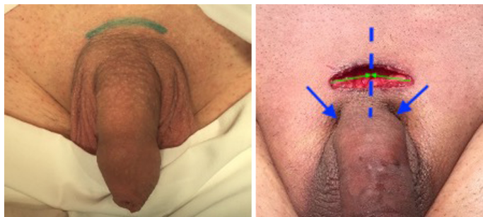
Figure 2. (1) Markup according to the developed cross-method; (2) Incision with schematic markup of the suture line (blue dash line) and refixation dots of cavernous bodies to the skin (marked with blue arrows).

The manuscript is allowed for publication in open sources by the local Institutional Review Board of State Institution of Science “Research and Practical Center of Preventive and Clinical Medicine,” protocol from November 03, 2020. The study was