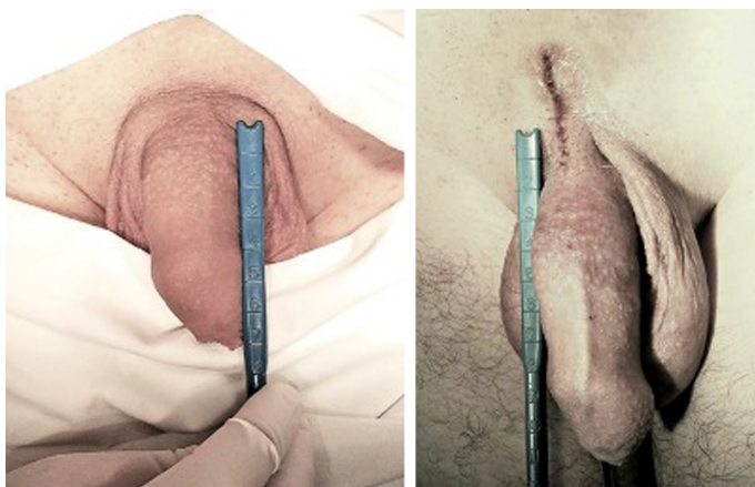
Figure 6. Before and after suspensory ligament division using the cross-method.

Totally, 65 suspensory ligament divisions were performed. The preoperative characteristics of 2 groups were similar (Table 1).