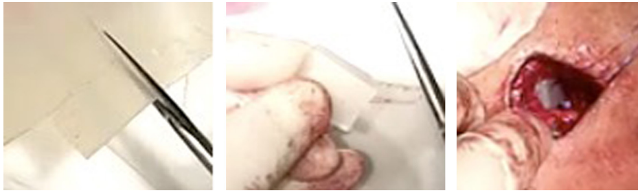
Figure 4. (1) Adjustment of silicone spacer; (2) Silicone spacer before insertion; (3) Inserted silicone spacer.