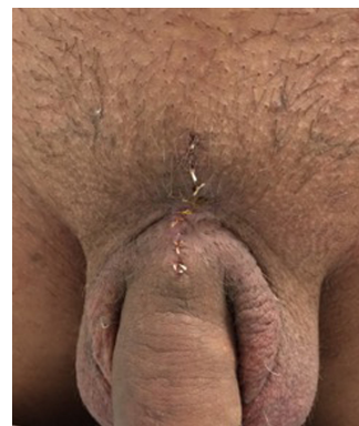
Figure 7. The view after surgery performed using the proposed cross-method.

The other part that positively affects self-esteem and postoperative satisfaction is aesthetics. 27 The division of the penile suspensory ligament can be performed through a simple transverse incision or some more complicated ones in order to avoid scar contracture and shortening of the length. For this purpose, several skin plasty methods were investigated in the literature: M-plasty, V-Y-plasty (the most common and widely used),