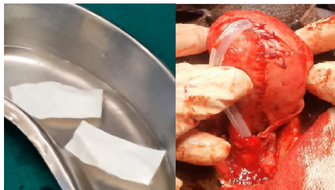
Figure 1. Acellular tissue engineered pericardial patch in normal saline (cut in two pieces) with quilted acellular tissue engineered pericardial patch with silicon Foley's catheter in situ.

The total number of patients included in the study was 28. Out of these six patients were excluded from the final results as three patients lost follow-up and 3 patients withdrew during the study period. The final sample size was 22 patients. Patients included in the final sample size were evaluated in terms of relevant history (presence of obstructive LUTS), physical and local examination, and urological evaluation including uroflowmetry, ultrasonogram Kidney Ureter and Bladder (KUB) region with postvoid residual urine, retrograde urethrogram (RGU), and micturating cystourethrogram and urethroscopy. Out of these 22 patients, seven patients had histopathologically proven balanitis xerotica obliterans (BXO) changes. Two patients underwent elective suprapubic